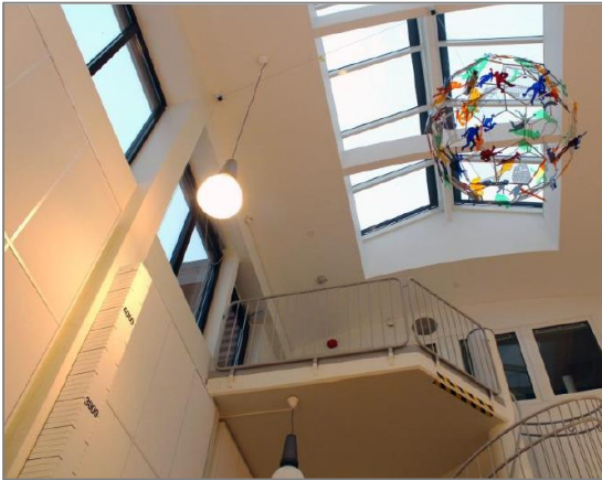
The SuperGraph chandelier in the lunch room of SP. The counter weight is designed as a ruler.