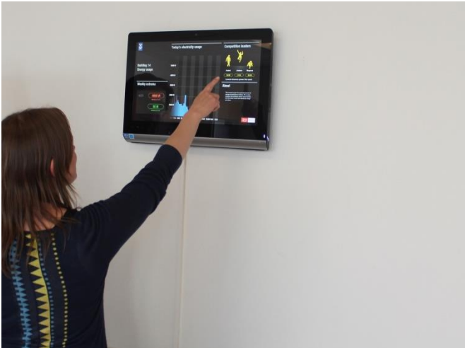
The ReflectoGraph visualisation is placed in the reception area.

The project had a high share of co-creation elements and has involved the employees to a large extent. Some examples of this approach are the initial workshop on visualization concepts together with employees, focusing on how the employer should encourage energy efficient behaviour and what data would be interesting to display. Next, the feedback interface was improved in a design workshop, where employees were encouraged to draw, cut, paste and describe their ideas for a visualization screen concept. Furthermore, an inauguration event was organized to install the ambient visualization, the SuperGraph, where all office workers were invited to contribute to the chandelier by mounting a personal avatar.